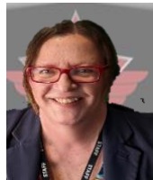
NICKI HEAD TEACHER