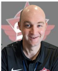
DAN DEPUTY DESIGNATED SAFEGUARDING