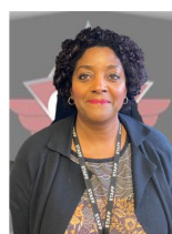
ANN WELL-BEING AND THERAPEUTIC LEAD